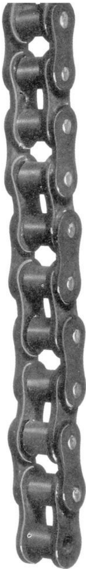
普通链 Normal chains